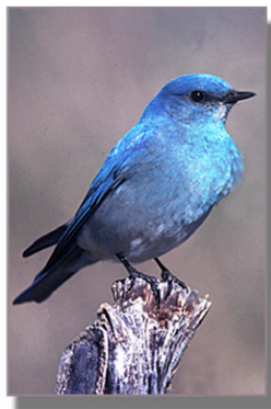
Male Mountain Bluebird