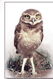
Sage Grouse and Burrowing Owl