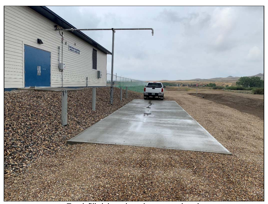
Truck fill slab and roadway completed.