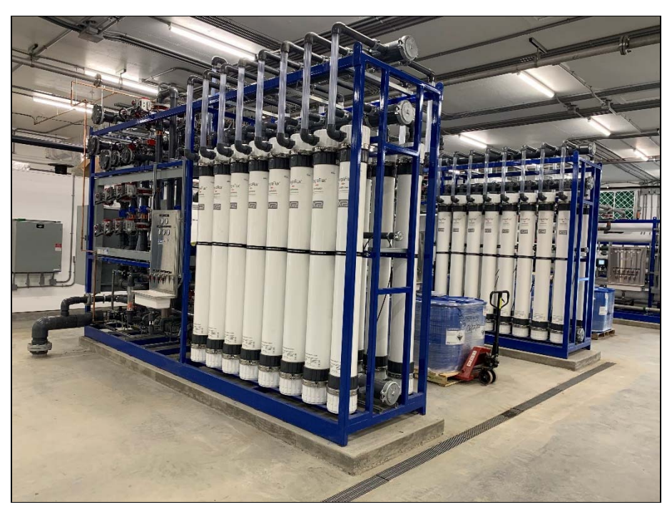
Ultrafiltration systems now operational.