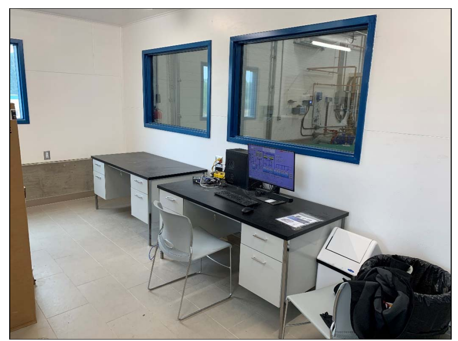
Office partially set up; remaining furniture and equipment to be unboxed prior to commissioning.