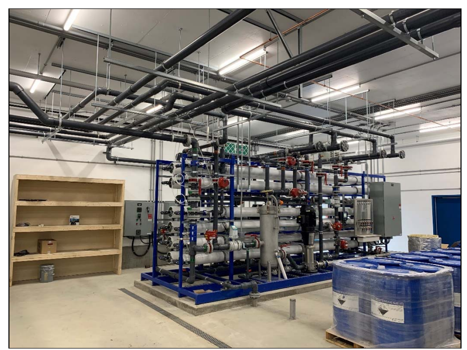
Nanofiltration systems now operational.