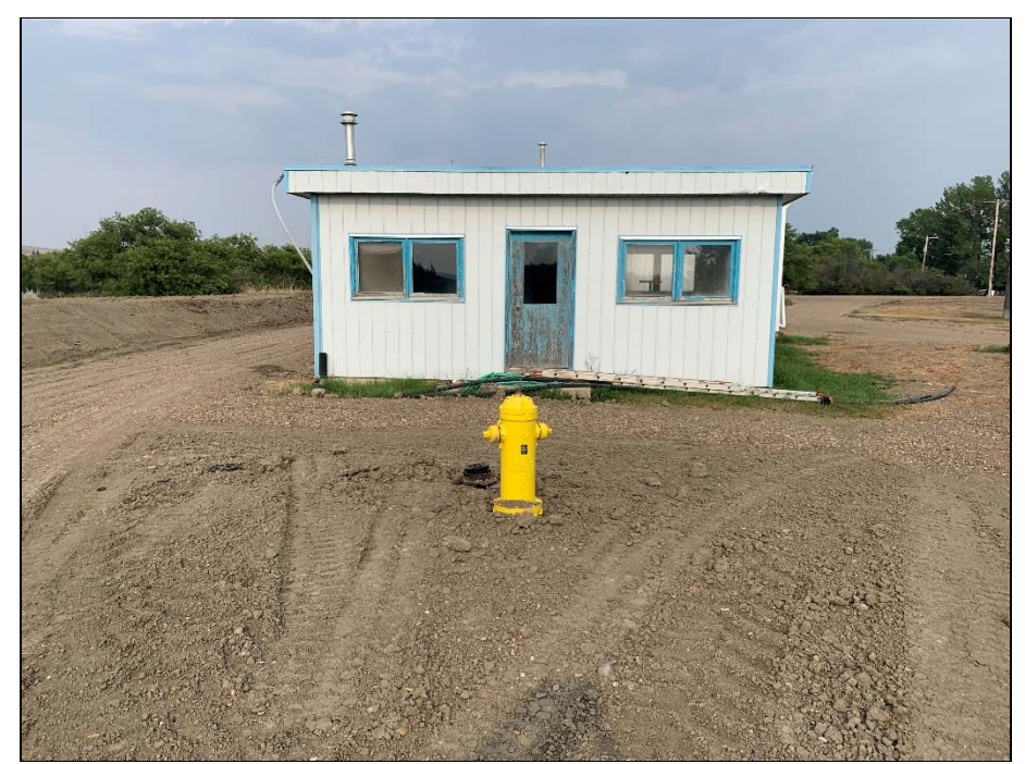
Flushing hydrant (Change Order #7) installed near old WTP.