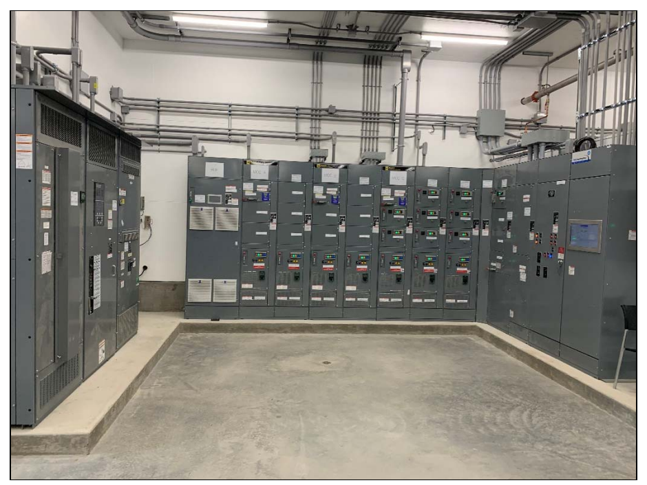
Electrical equipment area completed.