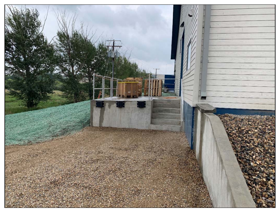
Loading dock grading completed; hydroseeding on backfill at left.