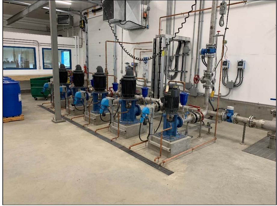
Distribution pumps are providing water to the town.