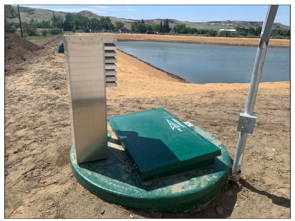
Effluent pumping station.