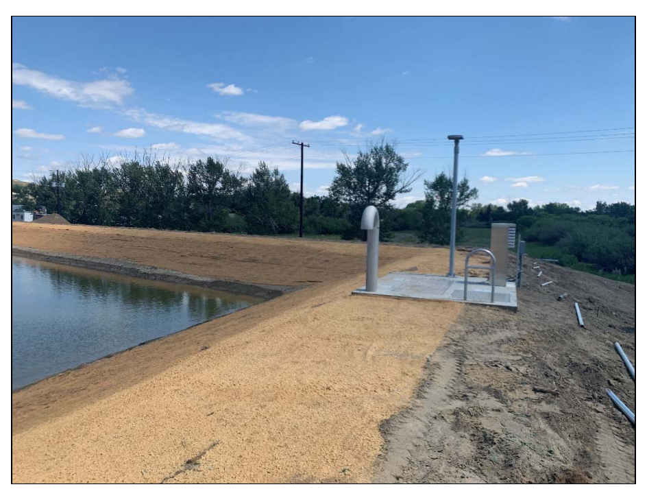
River intake pumping station.