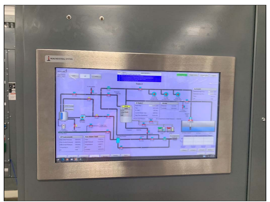
Control panel is now active and Delco working on testing programming.