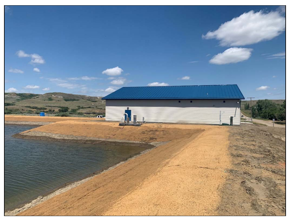
Erosion protection and seeding on interior face of raw water reservoir.