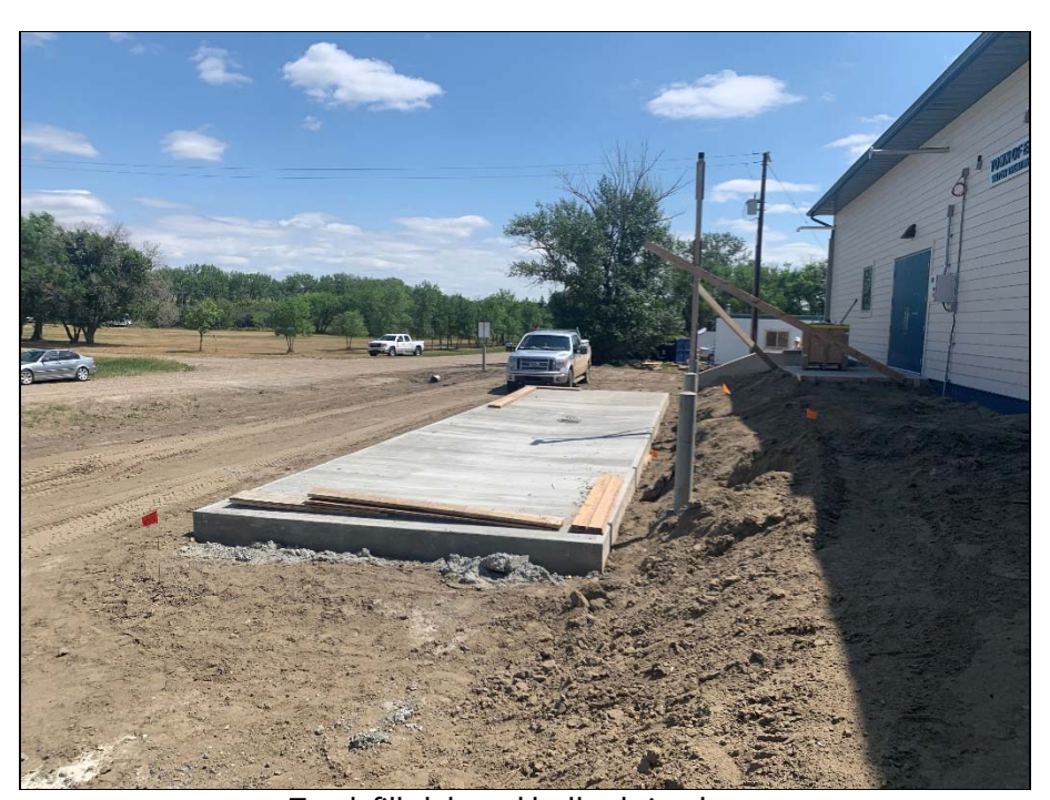
Truck fill slab and bollards in place.