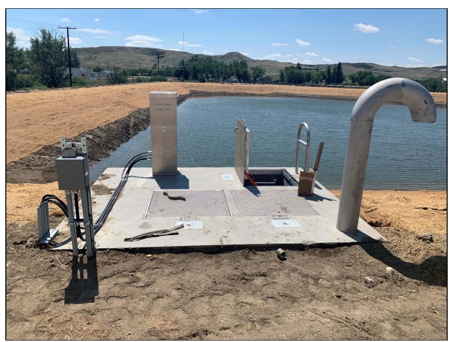
Reservoir intake pumping station.