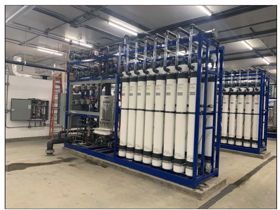
Ultrafiltration membranes (white vessels) are now loaded up and starting to filter water.