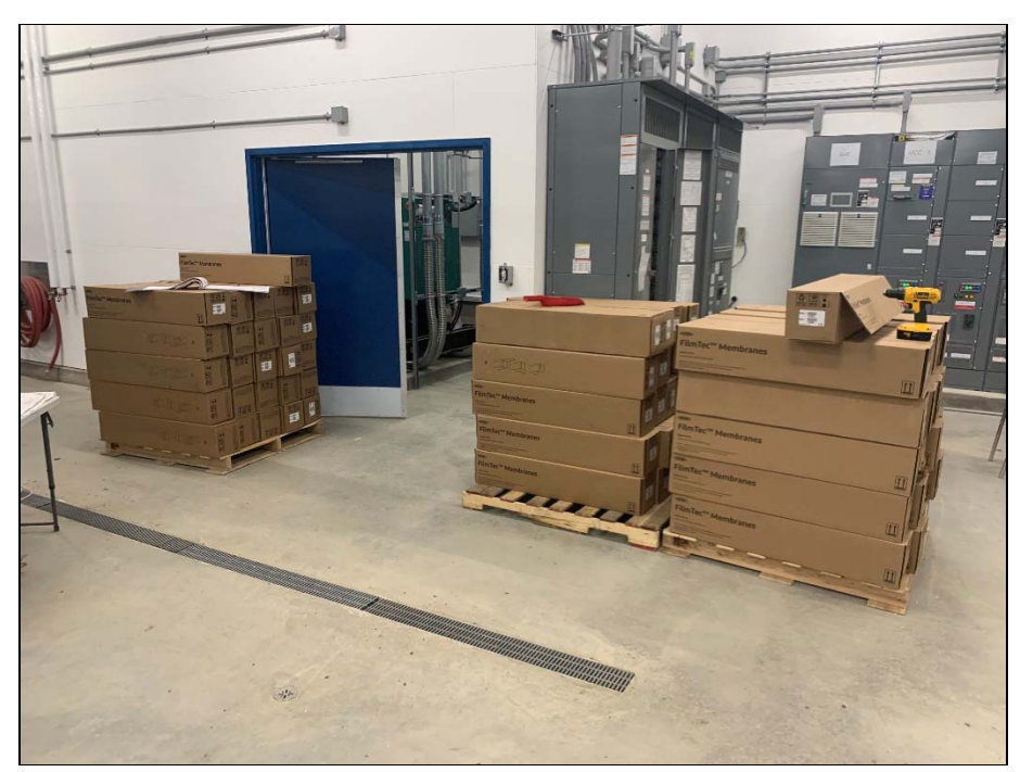
Nanofiltration membranes on site and ready to be loaded (have since been installed).