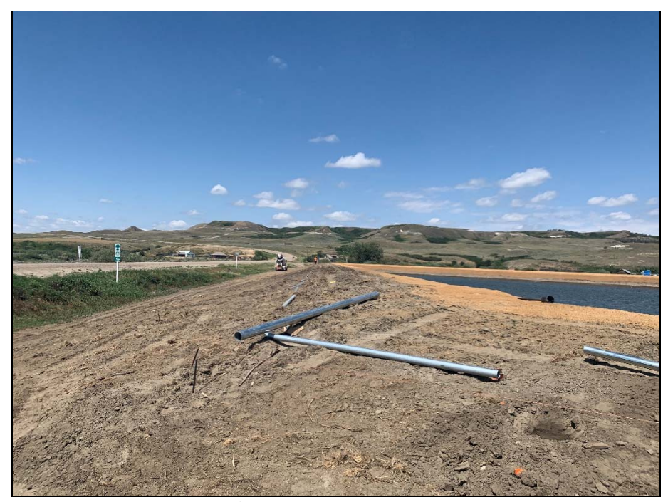
Chain link fencing starting; materials on site.